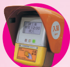
入站收費器 Entry Fare Processor