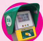
出站收費器 Exit Fare Processor