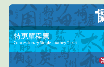
Concessionary Single Journey Ticket – First Class

Eligible full-time students studying in Hong Kong or eligible persons with disabilities wishing to enjoy concessionary fares must travel by a Personalised Octopus with “Student Status” or “Persons with Disabilities Status” respectively. For details, please refer to the “MTR Octopus Fare Chart for Eligible Students” and “MTR Octopus Fare Charts for the Public Transport Fare Concession Scheme for the Elderly and Eligible Persons with Disabilities”.