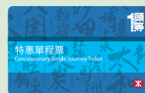
特惠單程票 — 頭等

於本港就讀的合資格全日制學生或合資格殘疾人士如欲享受特惠車費，必須使用「學生身分」或「殘疾人士身分」個人八達通，有關詳情請參閱「合資格學生港鐵八達通車費表」或「長者及合資格殘疾人士公共交通票價優惠計劃港鐵八達通車費表」。