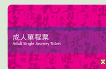
Adult Single Journey Ticket

Concessionary Tickets are available for children aged 3 to 11 and senior citizens aged 65 or above. Students aged 12 and above travelling with Single Journey Tickets are required to pay full adult fare.