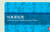
Concessionary Single Journey Ticket

First Class Service is available on the East Rail Line. Passengers may enjoy the First Class Service by paying a premium equivalent to the Standard Class Fare of the East Rail Line journey. First Class Single Journey Tickets can be purchased from Ticket Issuing Machines in East Rail Line stations or from Customer Service Centre in any MTR station.