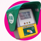
出站收費器 Exit Fare Processor