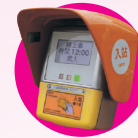
入站收費器 Entry Fare Processor