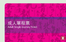
Adult Single Journey Ticket

Concessionary Tickets are available for children aged 3 to 11 and senior citizens aged 65 or above. Students aged 12 and above travelling with Single Journey Tickets are required to pay full adult fare.