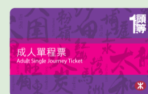
Adult Single Journey Ticket – First Class

First Class Service is available on the East Rail Line. Passengers may enjoy the First Class Service by paying a premium equivalent to the Standard Class Fare of the East Rail Line journey. First Class Single Journey Tickets can be purchased from Ticket Issuing Machines in East Rail Line stations or from Customer Service Centre in any MTR station.