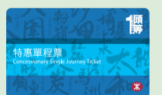
Concessionary Single Journey Ticket – First Class

Eligible full-time students studying in Hong Kong or eligible persons with disabilities wishing to enjoy concessionary fares must travel by a Personalised Octopus with “Student Status” or “Persons with Disabilities Status” respectively. For details, please refer to the “MTR Octopus Fare Chart for Eligible Students” and “MTR Octopus Fare Charts for the Public Transport Fare Concession Scheme for the Elderly and Eligible Persons with Disabilities”.