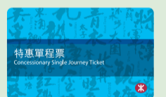
Concessionary Single Journey Ticket

First Class Service is available on the East Rail Line. Passengers may enjoy the First Class Service by paying a premium equivalent to the Standard Class Fare of the East Rail Line journey. First Class Single Journey Tickets can be purchased from Ticket Issuing Machines in East Rail Line stations or from Customer Service Centre in any MTR station.