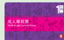
成人單程票 - 頭等

東鐵綫列車設有頭等車廂服務。使用頭等車廂的乘客必須支付頭等額外費，費用相等於該程東鐵綫車程的普通等車費。頭等單程票於東鐵綫車站內的售票機，或任何港鐵站的客務中心有售。