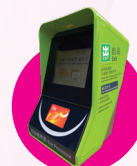
出站收費器 Exit Fare Processor