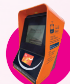
入站收費器 Entry Fare Processor