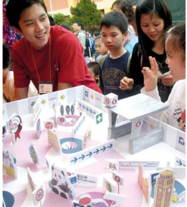
ABOVE The "More Time Reaching Community" scheme supported 81 initiatives involving over 1,500 volunteers

Success during the year included two Company apprentices being awarded the Outstanding Apprentices/Trainees Award by the Vocational Training Council. The Company has won similar awards for nine consecutive years. In addition, 17 trainers successfully acquired China's National Enterprise Trainer Qualification, which will help support our growth strategy in the Mainland of China.