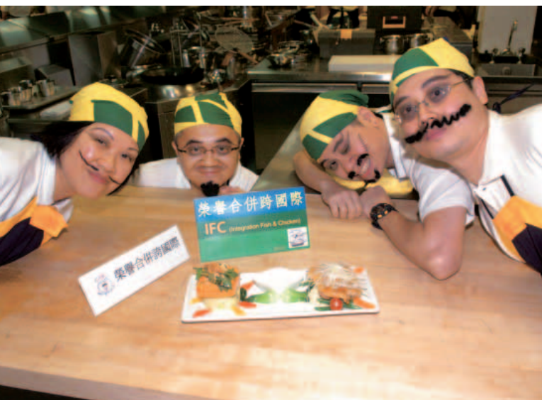
Progressive integration activities such as cookery competition were held to foster team spirit