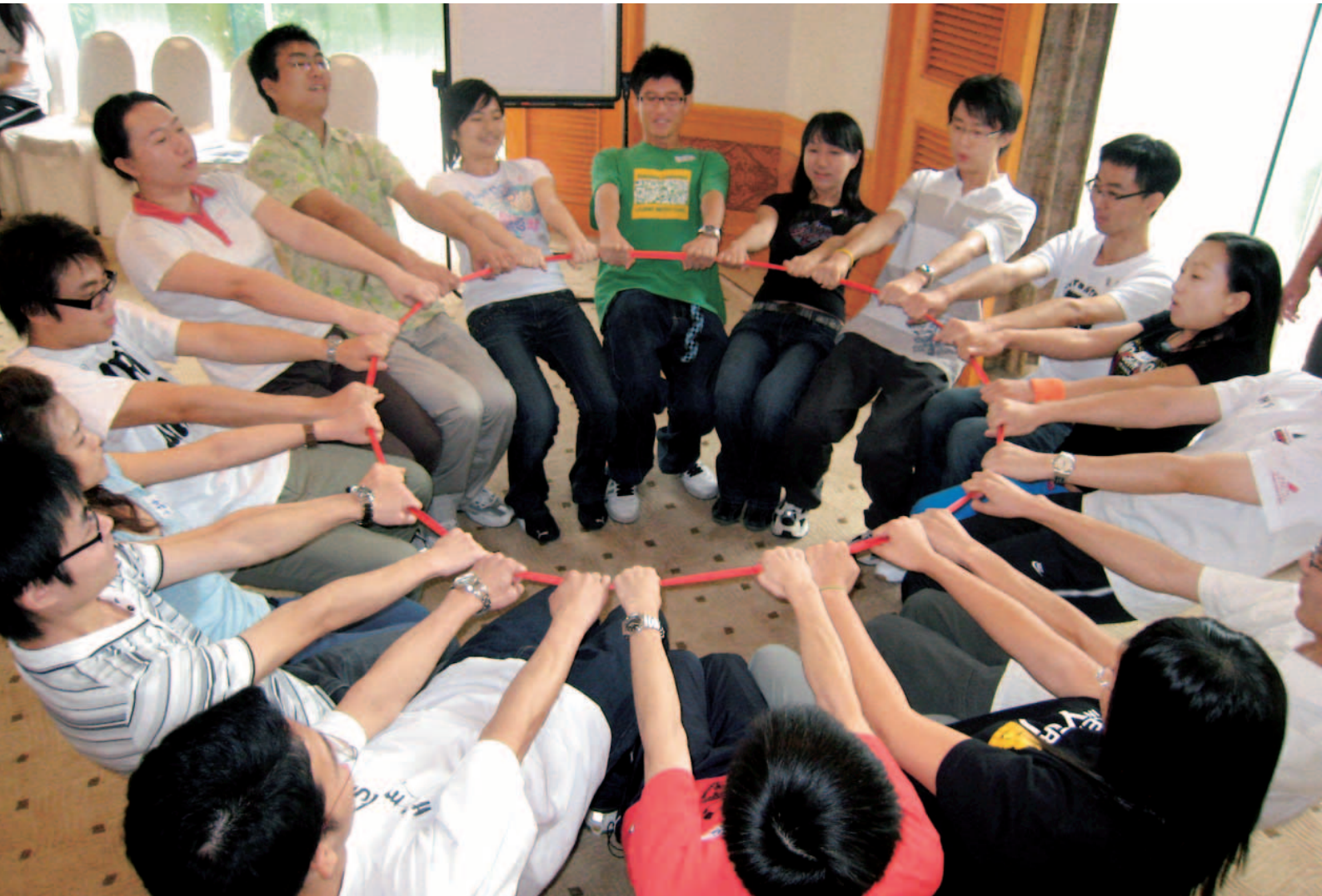
Our staff exemplified trust and a mutually supporting working culture in team building

The Company's success has been built on the commitment, caring service and professionalism of our staff. We have always regarded people as our most important asset, driving our business expansion and enabling the Company to adapt to changes. The Rail Merger created a significant opportunity for us to integrate as "One Company, One Team" thereby making the Company stronger, more energetic, more competitive and more united as we aspire to be the finest railway company in the world.