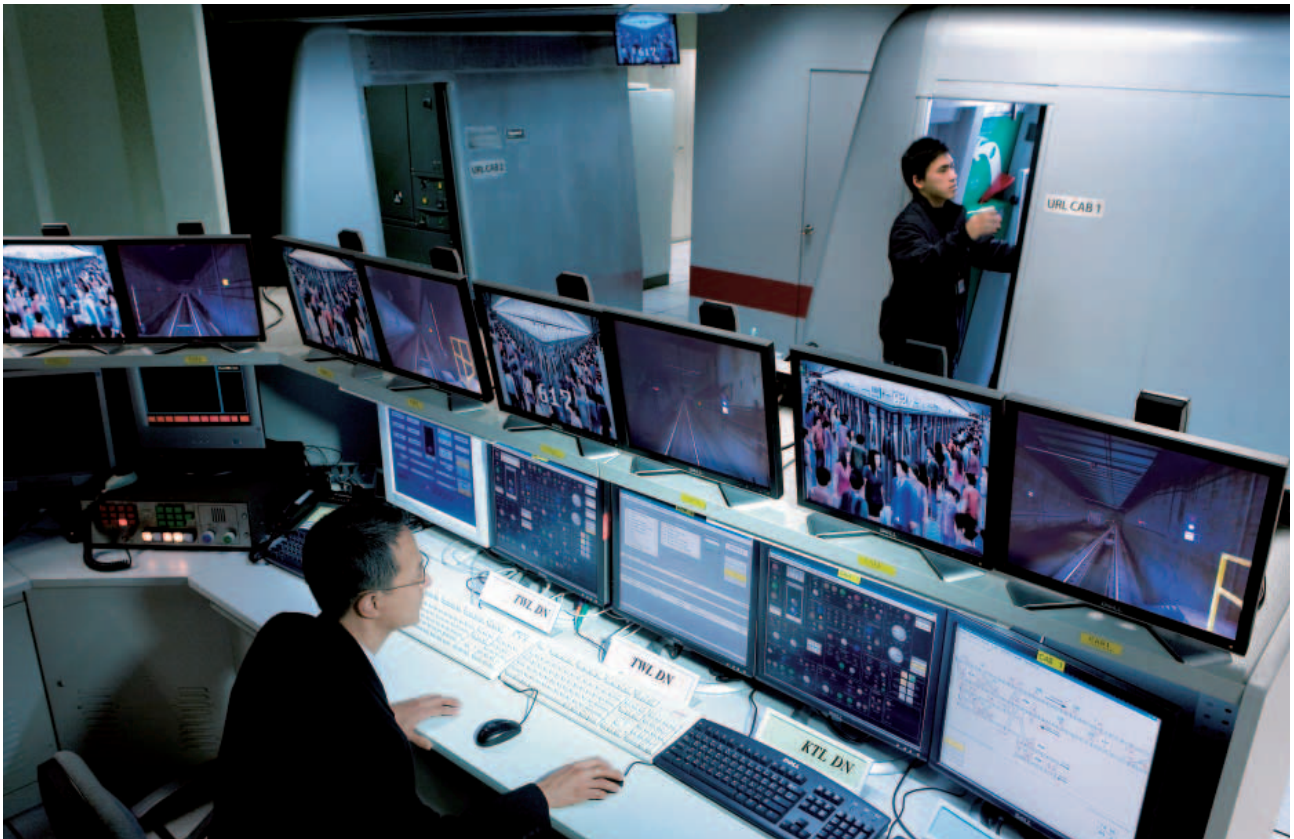
Train Simulator in Kowloon Bay Training Centre to ensure staff competency

his/her mentor. This served the dual purpose of developing the Associate as well as our high potential senior managers.