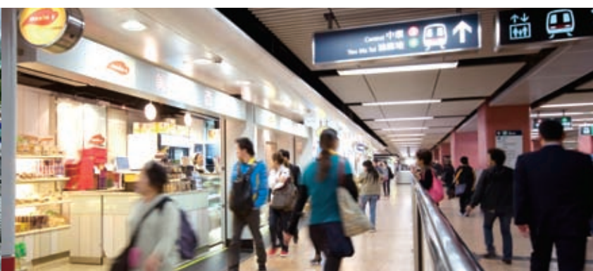
Station Commercial and Rail Related Businesses