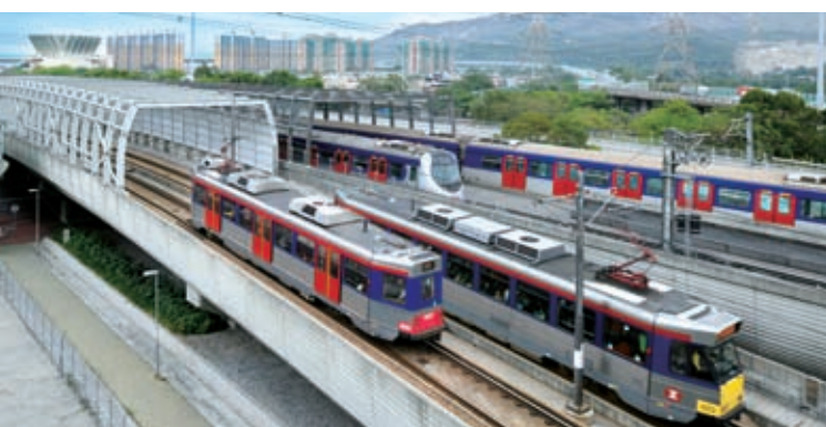
Hong Kong Passenger Services

Since the opening of our first line in Hong Kong some 30 years ago, the size, scale, geographic coverage and diversity of the Company's business activities have steadily developed. Following the Rail Merger, our strategy for future growth has remained firmly on track with significant network expansion in Hong Kong and the capturing of growth opportunities in the Mainland of China and overseas.