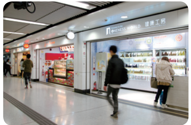
Shops in MTR stations provide passengers with a varied shopping experience

In order to meet passengers' increasing demand for mobile data, we facilitated two telecommunication operators to improve their 3G mobile data handling capacity at 15 key stations, and assisted two more operators to enhance their mobile phone reception on the MTR network.