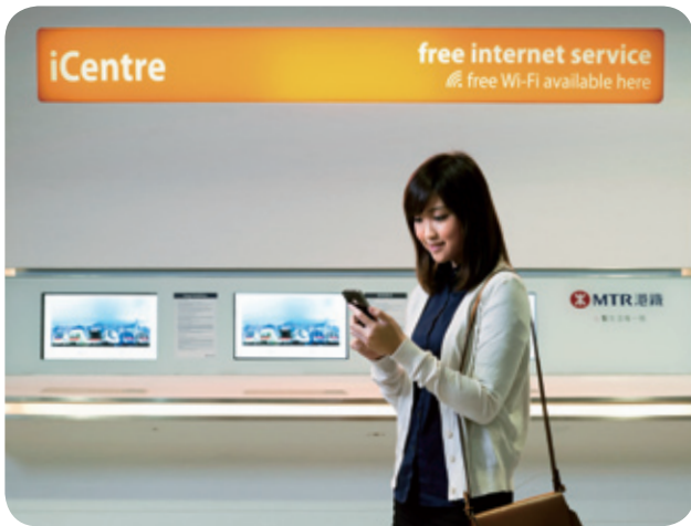
Our iCentres provide free Internet and Wi-Fi service to passengers