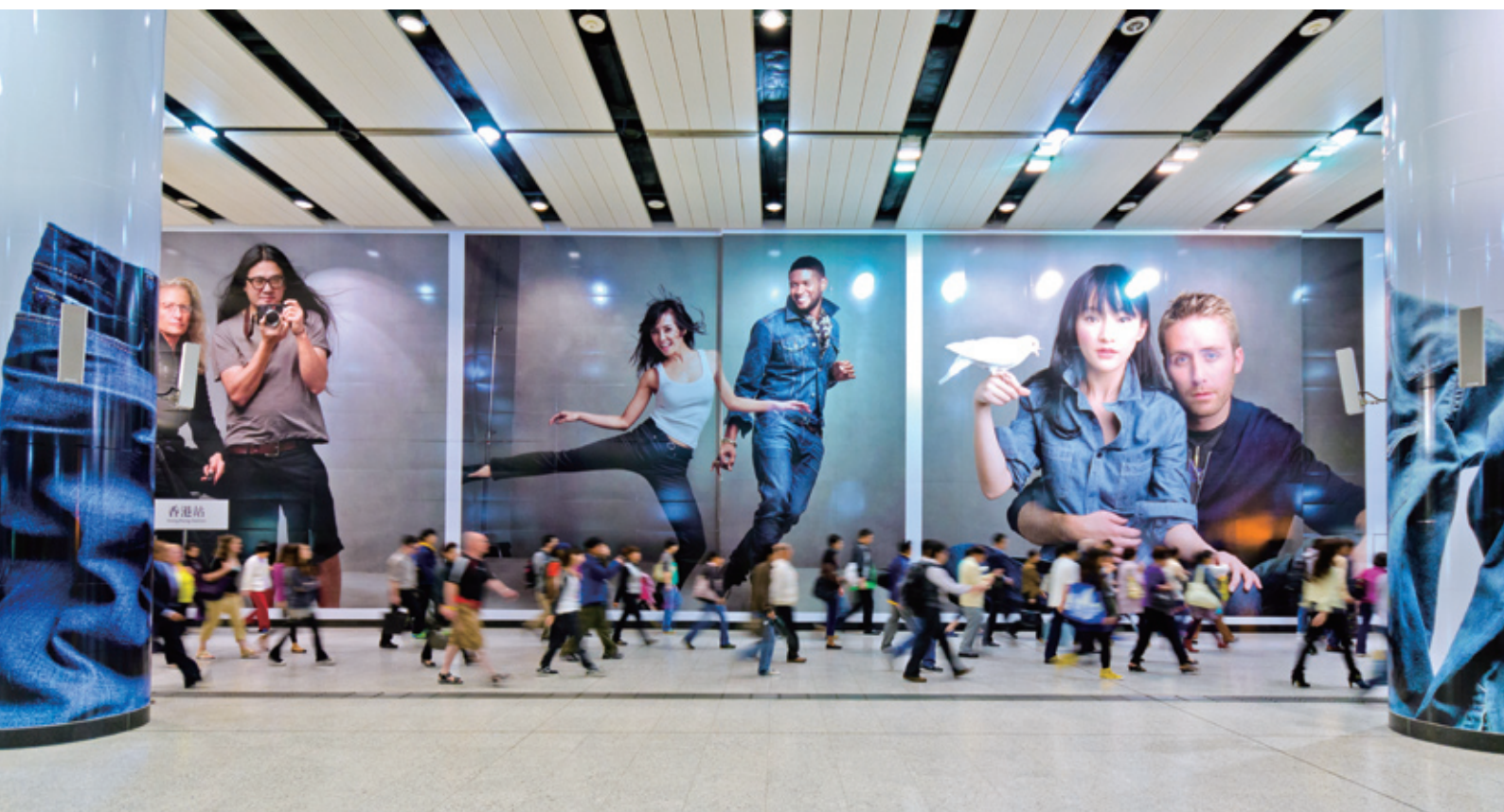
Hong Kong Station takes advertising to new heights

To reinforce the “stylish convenience” positioning of MTR shops in the minds of tenants and passengers, several branding and promotional campaigns were launched. There was a thematic advertising campaign and a series of poster campaigns to introduce new shops. An “MTR Shops’ Top Chic Products Poll” increased shoppers’ awareness of the wide range of trades in our stations. Other promotional campaigns during the year that aimed to stimulate or reinforce the shopping habits of passengers included the “Lok Ma Chau Group Travel Promotion” schemes, MTR Club “Bonus Points Scheme” using Bonus Points Cards and the popular “MTR Shops Unwrap Your Prize!” campaign.