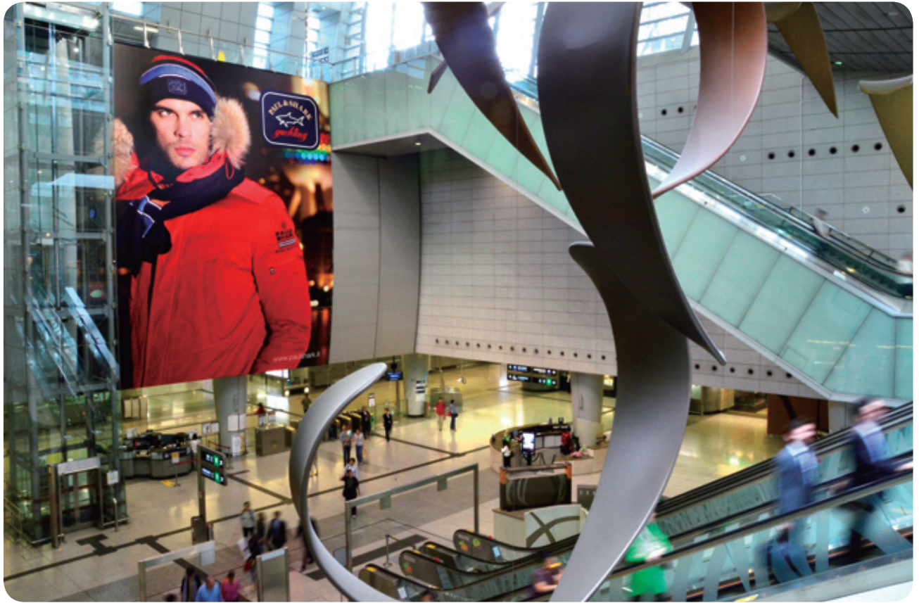
This giant billboard adds to the excitement at Kowloon Station