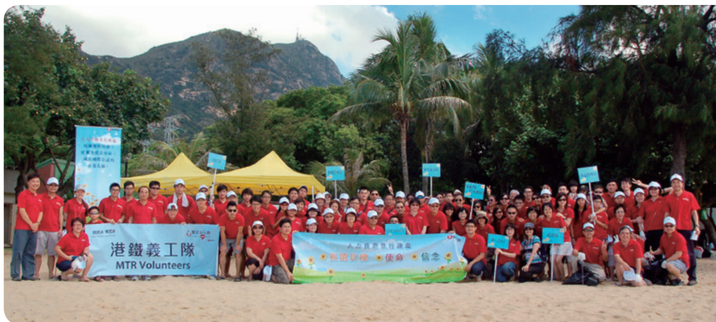
Various activities were launched to promote the Company's Vision, Mission and Values

In addition to providing general and competency based operations, technical and safety training for core and growth businesses, the Company also takes initiatives to identify and develop talented individuals for future leadership roles. One of our people development programmes is the Executive Associate Programme. The second and third batches of Executive Associates have been progressing well and have given very positive feedback. The assessment process for the fourth batch of Executive Associates was completed in October 2011.