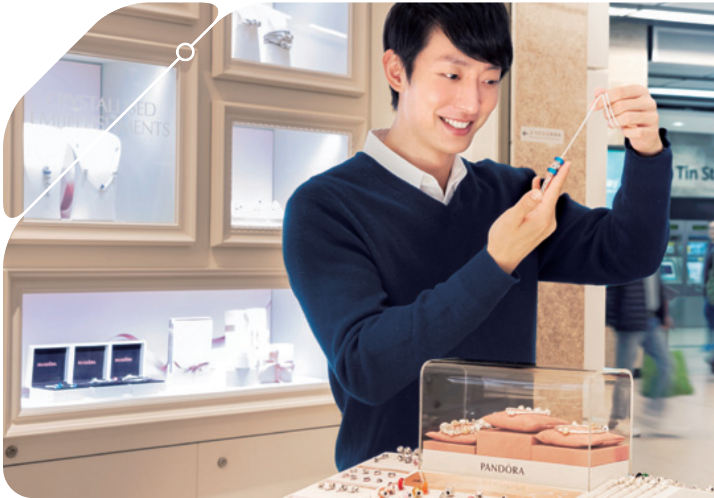
We continue to introduce new brands to MTR Shops to improve passengers' satisfaction