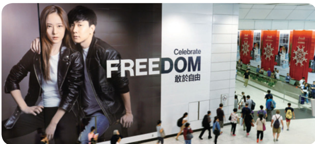
Hong Kong Station interchange provides extensive advertising opportunities

Revenue from telecommunications in 2015 was 14.4% higher at HK$548 million. The increase was due to a one-off project administration fee, incremental revenue from new stations on the Western extension of the Island Line and mobile data capacity enhancement projects by operators. Installation for the provision of mobile phone and Wi-Fi services continues along the new South Island Line (East) and Kwun Tong Line Extension stations. MTR has also agreed with all mobile network operators to build a new mobile network offering increased data capacity and more 4G services at eight busy stations. The project is now in the tendering stage.