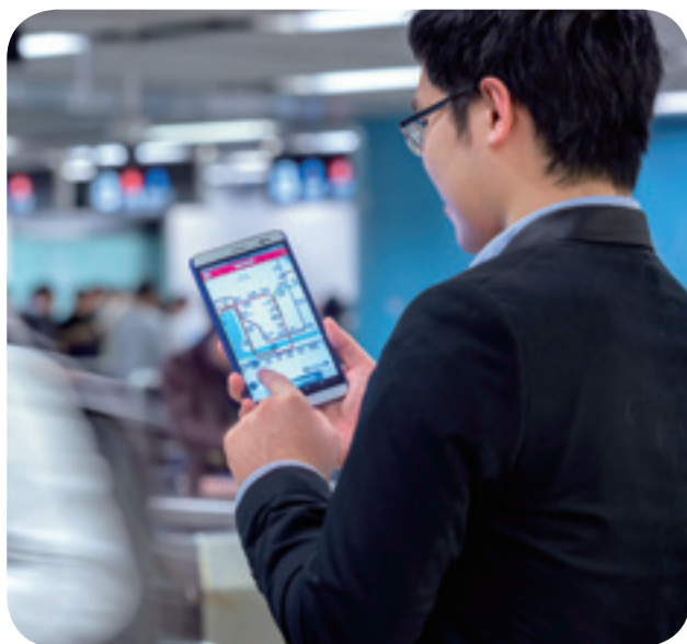
Telecom operators continue to enhance mobile data capacity on our network

Renovation works at Wan Chai and Admiralty stations to facilitate the station improvement programme and the construction works of the Shatin to Central Link respectively resulted in the closure of some outlets, partially offsetting the new shops that opened during the year. In 2015, 25 new brands were introduced, with posters featuring selected new brands displayed across the MTR network.