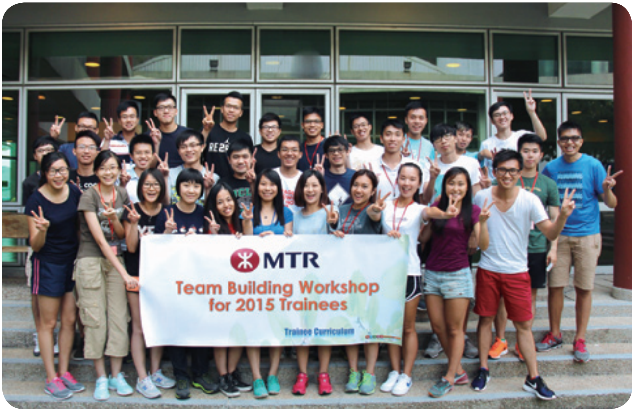
Various graduate development programmes are provided to groom and develop our young professionals

Development in the US. MTR was one of only five companies to achieve the Hong Kong Management Association's "25 th Anniversary Award: Most Dedicated Organisation to People Development", recognising the Company's outstanding achievements in staff development over the years.