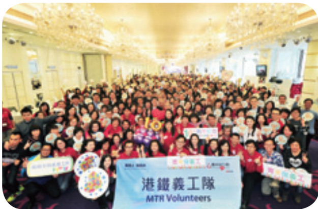
Through the More Time Reaching Community Scheme, we engage our staff in providing volunteering service to the community

The internal global communication platform, MTRconnects, was used to engage staff worldwide through sharing corporate updates and stories about MTR people. The platform's view rate had reached over 563,000 by year-end, with more than 13,300 unique visitors recorded.