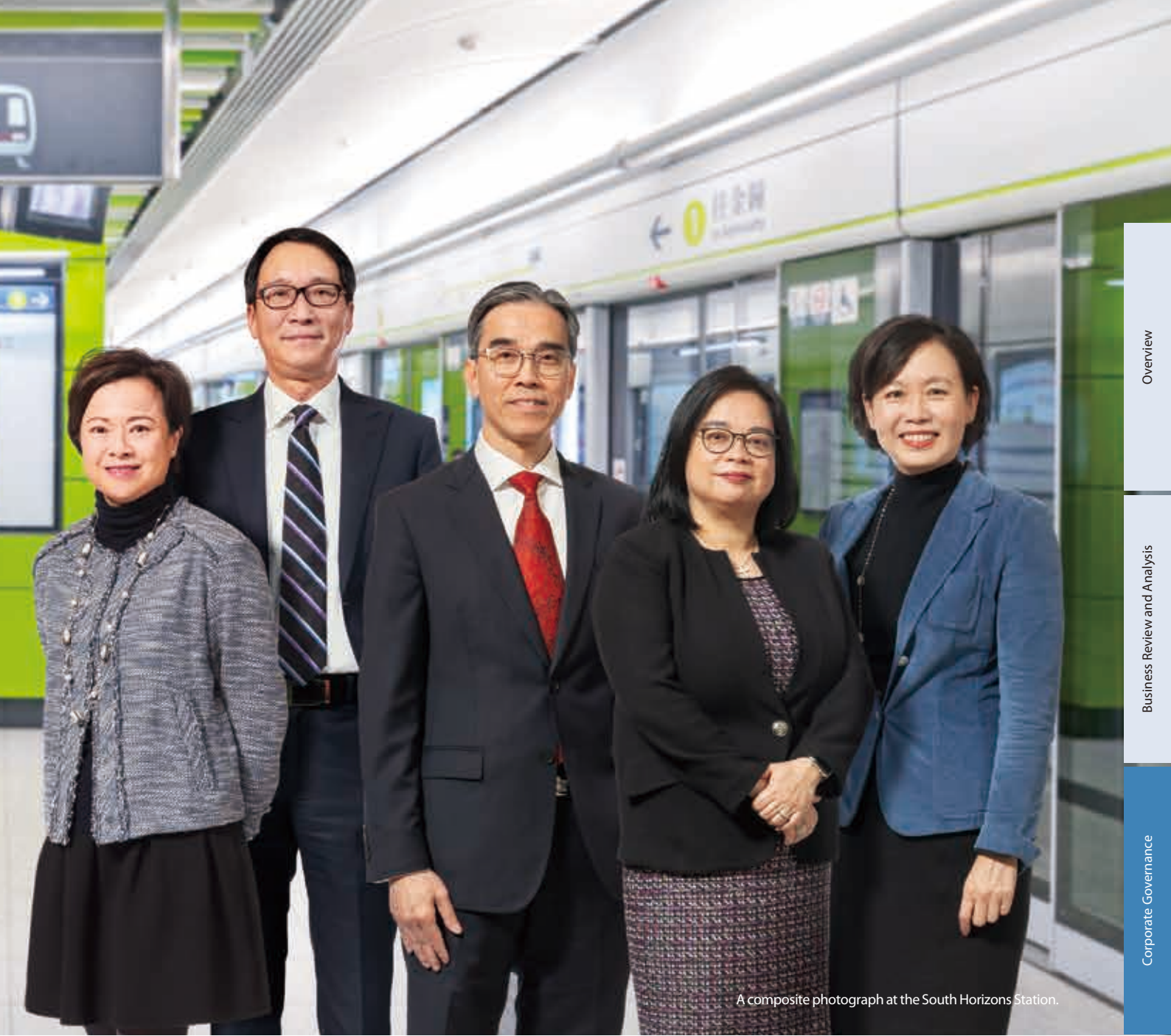
A composite photograph at the South Horizons Station.