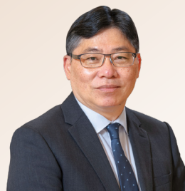
Secretary for Transport and Logistics @ (Lam Sai-hung)