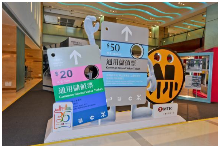
Photo spot where visitors can take pictures of themselves framed in classic magnetic ticket designs.