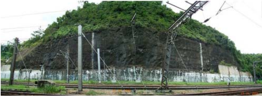
改善後 After Improvement