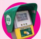
出站收費器 Exit Fare Processor