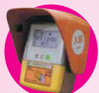
入站收費器 Entry Fare Processor