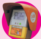
入站收費器 Entry Fare Processor