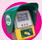
出站收費器 Exit Fare Processor