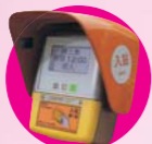
入站收費器 Entry Fare Processor