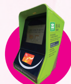
出站收費器 Exit Fare Processor