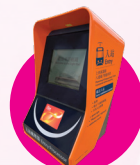
入站收費器 Entry Fare Processor