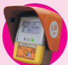
入站收費器 Entry Fare Processor

使用八達通的乘客必須於登車車站之「入站收費器」上拍卡確認入站，待綠燈亮起，屏幕上顯示「請上車」，並發出成功確認的聲響，方可前往乘車。車程不能超過120分鐘。