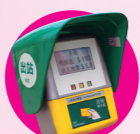
出站收費器 Exit Fare Processor

確認入站時，系統會按八達通票種先扣除輕鐵最高車費。確認出站時，系統會將入站時多付的車費退回八達通內。