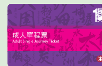
成人單程票 — 頭等

東鐵綫列車設有頭等車廂服務。使用頭等車廂的乘客必須支付頭等額外費，費用相等於該程東鐵綫車程的普通等車費。頭等單程票於東鐵綫車站內的售票機，或任何港鐵站的客務中心有售。