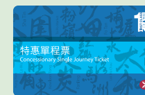
特惠單程票 — 頭等

於本港就讀的合資格全日制學生或合資格殘疾人士如欲享受特惠車費，必須使用「學生身分」或「殘疾人士身分」個人八達通，有關詳情請參閱「合資格學生港鐵八達通車費表」或「長者及合資格殘疾人士公共交通票價優惠計劃港鐵八達通車費表」。