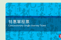
Concessionary Single Journey Ticket

First Class Service is available on the East Rail Line. Passengers may enjoy the First Class Service by paying a premium equivalent to the Standard Class Fare of the East Rail Line journey. First Class Single Journey Tickets can be purchased from Ticket Issuing Machines in East Rail Line stations or from Customer Service Centre in any MTR station.