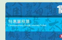
Concessionary Single Journey Ticket – First Class

Eligible full-time students studying in Hong Kong or eligible persons with disabilities wishing to enjoy concessionary fares must travel by a Personalised Octopus with “Student Status” or “Persons with Disabilities Status” respectively. For details, please refer to the “MTR Octopus Fare Chart for Eligible Students” and “MTR Octopus Fare Charts for the Public Transport Fare Concession Scheme for the Elderly and Eligible Persons with Disabilities”.