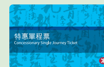
Concessionary Single Journey Ticket

First Class Service is available on the East Rail Line. Passengers may enjoy the First Class Service by paying a premium equivalent to the Standard Class Fare of the East Rail Line journey. First Class Single Journey Tickets can be purchased from Ticket Issuing Machines in East Rail Line stations or from Customer Service Centre in any MTR station.