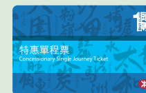
Concessionary Single Journey Ticket – First Class

Eligible full-time students studying in Hong Kong or eligible persons with disabilities wishing to enjoy concessionary fares must travel by a Personalised Octopus with “Student Status” or “Persons with Disabilities Status” respectively. For details, please refer to the “MTR Octopus Fare Chart for Eligible Students” and “MTR Octopus Fare Charts for the Public Transport Fare Concession Scheme for the Elderly and Eligible Persons with Disabilities”.