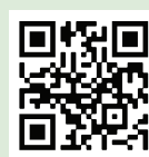
經MTR Mobile 購買電子單程票

東鐵綫列車設有頭等車廂服務。使用頭等車廂的乘客必須支付頭等額外費，費用相等於該程東鐵綫車程的普通等車費。乘客可透過MTR Mobile購買頭等電子單程票，或於東鐵綫車站內的售票機，或任何港鐵站內的客務中心購買實體頭等單程票。