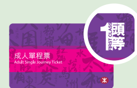
Adult Single Journey Ticket – First Class

First Class Service is available on the East Rail Line. Passengers may enjoy the First Class Service by paying a premium equivalent to the Standard Class Fare of the East Rail Line journey. First Class e-Single Journey Tickets can be purchased via the MTR Mobile app, while physical First Class Single Journey Tickets can be purchased at ticket machines from Ticket Issuing Machines in East Rail Line stations, or from the Customer Service Centres in any MTR station.