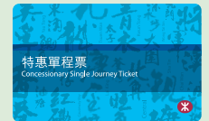
Concessionary Single Journey Ticket

First Class Service is available on the East Rail Line. Passengers may enjoy the First Class Service by paying a premium equivalent to the Standard Class Fare of the East Rail Line journey. First Class Single Journey Tickets can be purchased from Ticket Issuing Machines in East Rail Line stations or from Customer Service Centre in any MTR station.