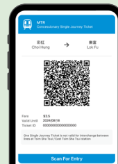
Concessionary e-Single Journey Ticket