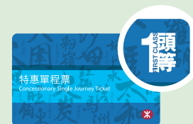
特惠單程票 — 頭等