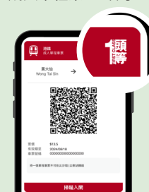
成人電子單程票 — 頭等