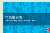
Concessionary Single Journey Ticket