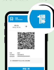
特惠電子單程票 — 頭等

於本港就讀的合資格全日制學生或合資格殘疾人士如欲享受特惠車費，必須使用「學生身分」或「殘疾人士身分」個人八達通，有關詳情請參閱「合資格學生港鐵八達通車費表」或「長者及合資格殘疾人士公共交通票價優惠計劃港鐵八達通車費表」。