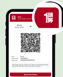
Adult e-Single Journey Ticket – First Class