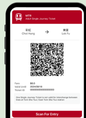
Adult e-Single Journey Ticket