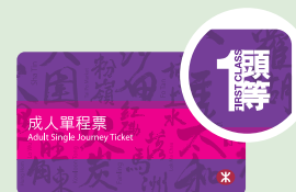
成人單程票 — 頭等

東鐵綫列車設有頭等車廂服務。使用頭等車廂的乘客必須支付頭等額外費，費用相等於該程東鐵綫車程的普通等車費。乘客可透過MTR Mobile購買頭等電子單程票，或於東鐵綫車站內的售票機，或任何港鐵站內的客務中心購買實體頭等單程票。