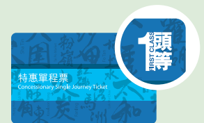
Concessionary Single Journey Ticket – First Class