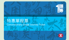
Concessionary Single Journey Ticket – First Class

Eligible full-time students studying in Hong Kong or eligible persons with disabilities wishing to enjoy concessionary fares must travel by a Personalised Octopus with “Student Status” or “Persons with Disabilities Status” respectively. For details, please refer to the “MTR Octopus Fare Chart for Eligible Students” and “MTR Octopus Fare Charts for the Public Transport Fare Concession Scheme for the Elderly and Eligible Persons with Disabilities”.