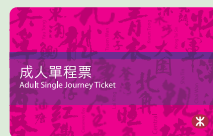
Adult Single Journey Ticket

Concessionary Tickets are available for children aged 3 to 11 and senior citizens aged 65 or above. Students aged 12 and above travelling with Single Journey Tickets are required to pay full adult fare.