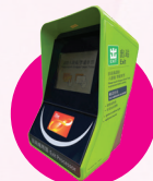
出站收費器 Exit Fare Processor