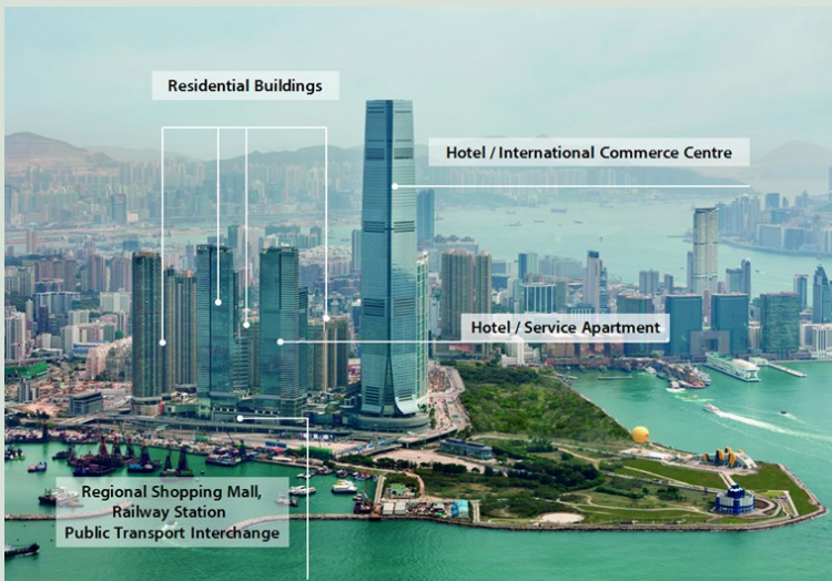
Kowloon Station, one of the TOD successes in Hong Kong

We adopt the “Rail + Property” integrated development model to capitalise on the synergy between property development and railway services. This offsets the railway construction capital, making us as one of the few profitable rail companies in the world. With our experience, we can provide advice on the best solutions to capitalise the property rights adjacent to a rail facilities and integrate the two elements – rail and property in a seamless way.