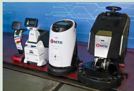
Robots deployed across HK network