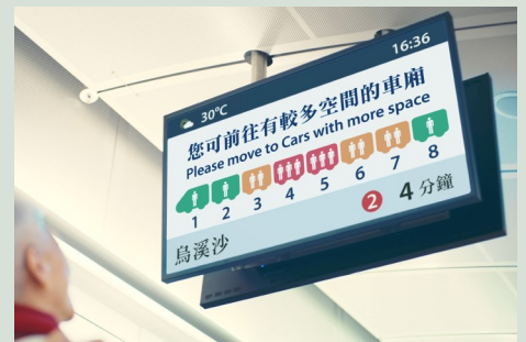
Train Car Loading Indicator