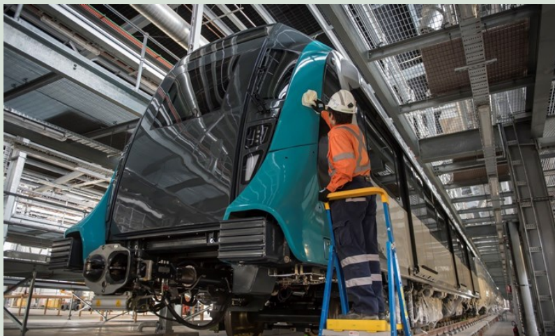
MTR uses an early involvement process throughout the entire fleet acquiring from design, planning, project, operating to maintenance.

MTR offers a wide range of solutions to maximise the life cycle value of rolling stock – from the study and implementation of asset life extension programmes, the selection and procurement of new fleets, to the cost estimation and execution planning of overhaul maintenance and refurbishment programme for existing fleets.