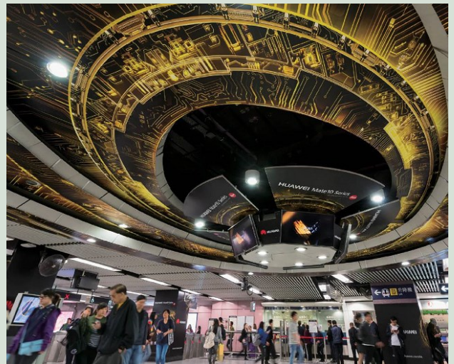
Bustling scene at one of our stations