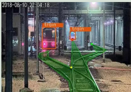
Track Intrusion Detection System

MTR is pioneering innovations to improve the safety and productivity of railway operations and maintenance. This includes digitalised track access management to minimise processing time and improve traceability, smart train planning to maximise fleet utilisation, and smart sensors for predictive maintenance.