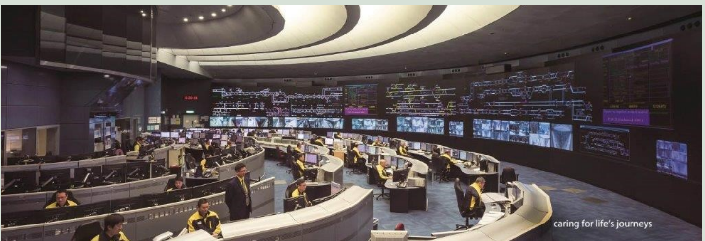
Our Operations Control Centre (“OCC”) controls the Hong Kong rail network from Tsing Yi

We provide a full range of O&M consultancy services to deliver innovative and tailored solutions to railway organisations, consultants and various government organisations across the globe.