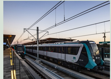
Metro, Airport Express, Sub-urban Rail, Light Rail, Intercity and High-speed Rail