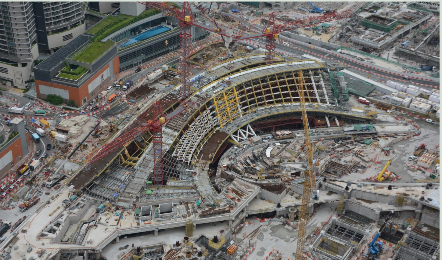
West Kowloon Terminus during construction

MTR has planned, designed and delivered complex railway projects with world-class standards. With increasing project complexity and public expectation, we ensure that key project objectives and requirements are met through risk management, innovation, financing and sustainable development. We develop solutions around our operational needs and requirements across our projects as we recognise its significance along a project's lifecycle.