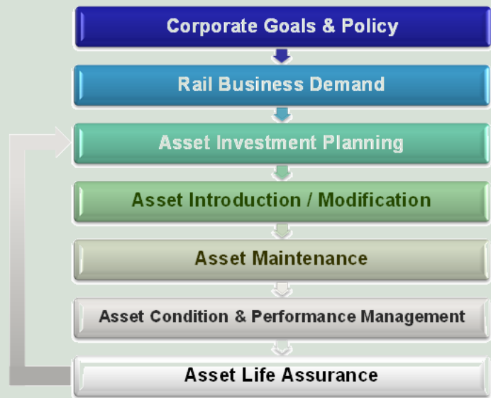
MTR Asset Management Framework

MTR is the first railway operator in the world to have obtained the ISO 55001 certification, which is the highest international standard on asset management. Our risk-based asset management framework helps the organisation with better operational and financial performance, from setting corporate goals & policy to asset life assurance.