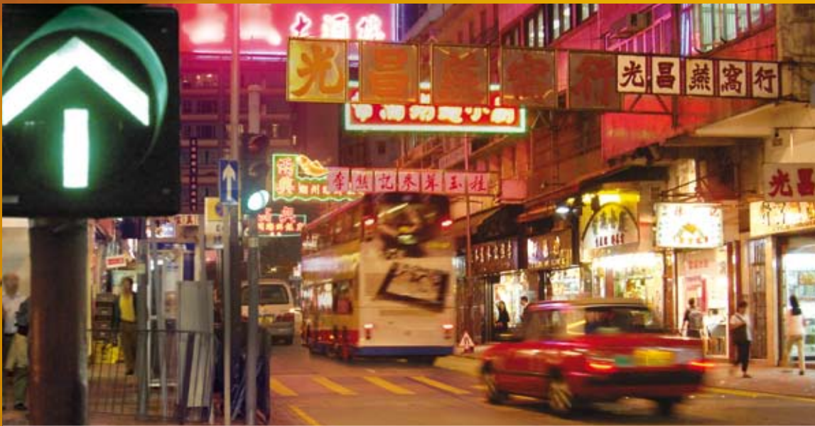
MAIN IMAGE A revised project proposal on the West Island Line was submitted to Government in August