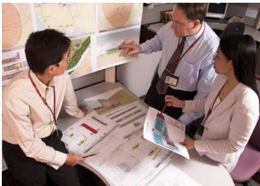
RIGHT The preliminary design study on West Island Line was completed in mid 2006

The Queensway Subway linking Admiralty Station with Three Pacific Place also opened in February 2007. The design of a pedestrian subway at Sai Yeung Choi Street South linking Pioneer Centre and Prince Edward Station is under review prior to works starting.