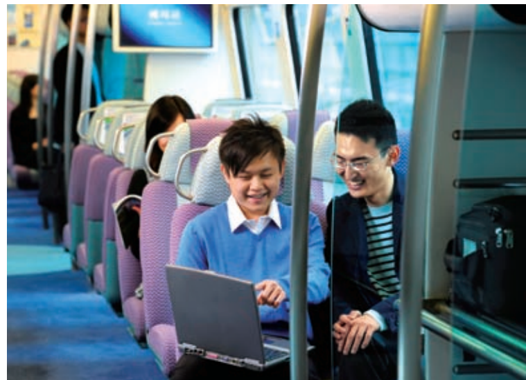
All Airport Express trains are now fully Wi-Fi enabled.