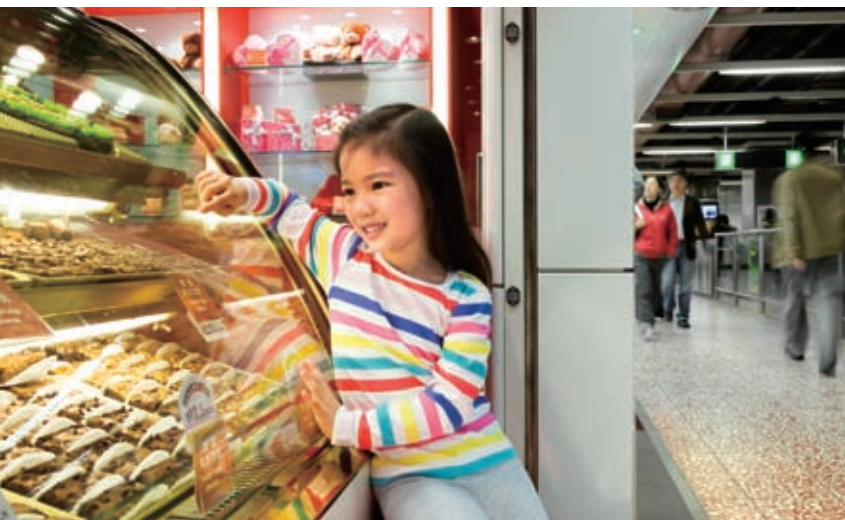
MTR shops offer a wide variety of products and services.