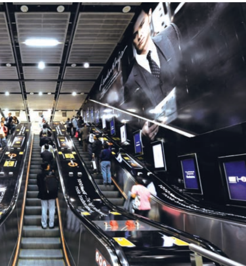
Our Digital Escalator Crown Bank offers an eye-catching medium of advertisement.