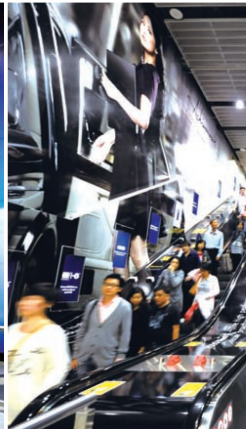
Hong Kong Station interchange provides extensive advertising opportunities.

escalator crown panels on the East Rail Line and West Rail Line. A programme of replacement and rationalisation of locations of advertising panels on the East Rail Line and West Rail Line has begun and will be completed in 2010. At the end of 2009, there were 20,742 advertising points in stations, 26,823 in trains (including 4,545 Liquid Crystal Displays) and 67 exhibition and display sites in 42 stations.