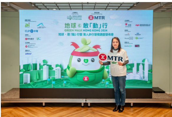
MTR Corporation fully supports Green WALK.