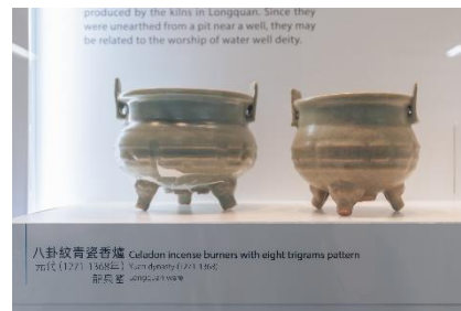
Celadon incense burners with eight trigrams pattern produced in Longquan kilns in Zhejiang.