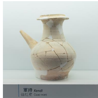
A Kendi which is a vessel used particularly for religious rituals, produced in Cizao Kilns.