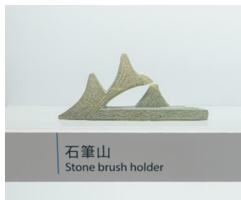
A stone brush holder, which was a common writing implement on scholars' desks.