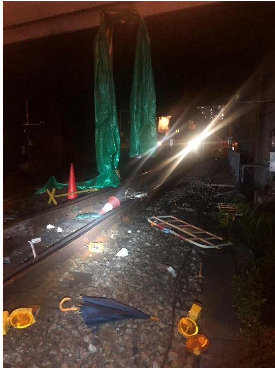
A section of track between Sha Tin and Fo Tan stations